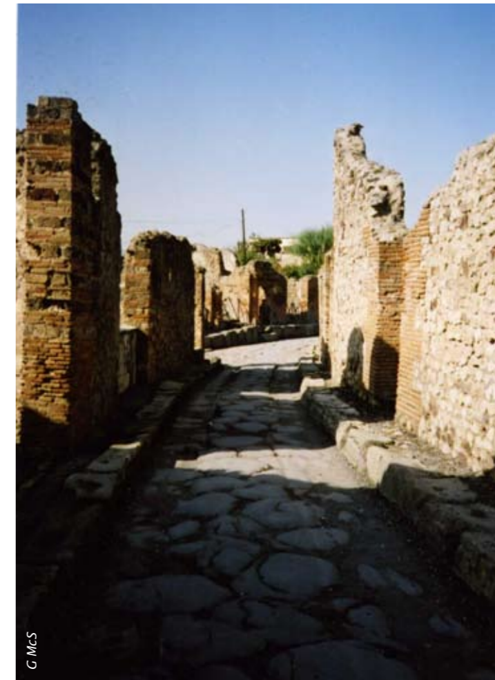
A Pompeii street today

So if you go to Italy one day, you can visit the restored city of Pompeii. You can cross the streets at the big stepping stones, and admire the bright colours on the walls of the houses. You can be