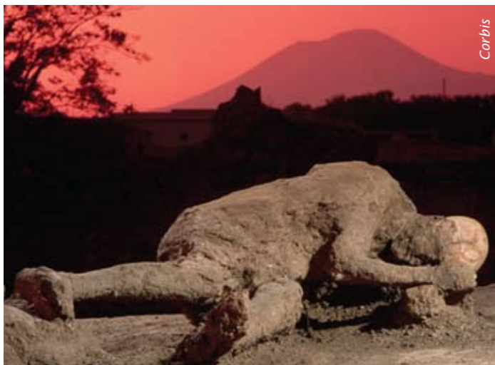
A cast of a Pompeian victim, with Vesuvius in the background.

They all died, and their bodies decayed like ordinary bodies, but the ash and stones and mud that settled around them kept their shapes as it cooled and hardened. And that is part of what makes Pompeii so famous. Hundreds of years later, when the ruins were being dug up, the workers would make plaster-of-Paris moulds from the empty spaces left in the rock. So a visitor today can see exactly how one person held his arms out, where another lay her head, how a dog died